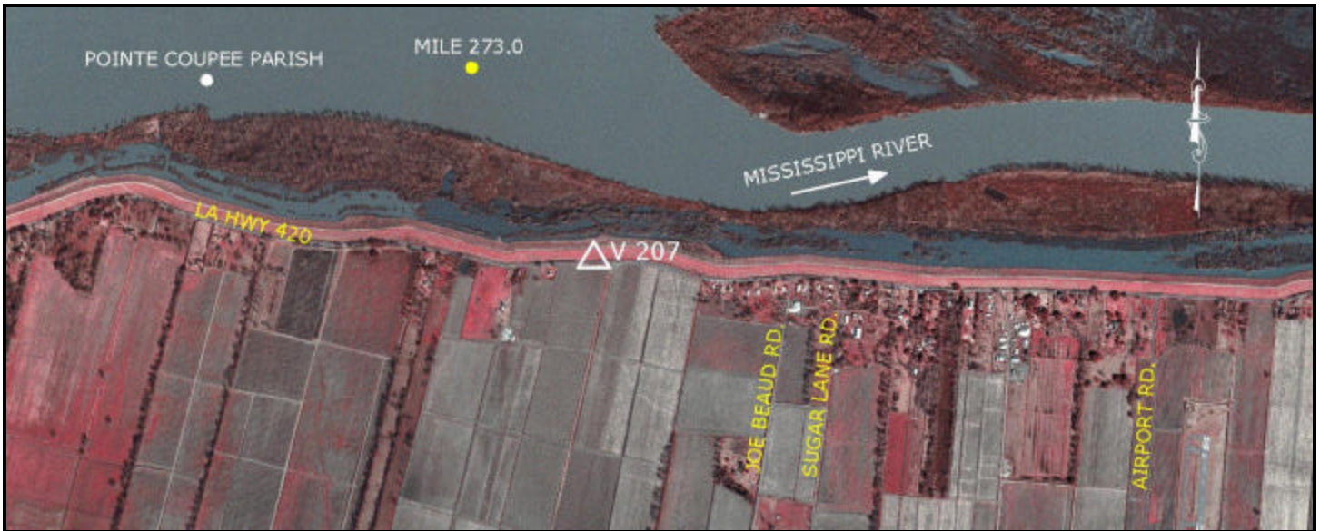
VICINITY MAP Scale: 1" = 2000' Reproduced from "Morganza and New Roads" DOQQ 2004 Quadrangle